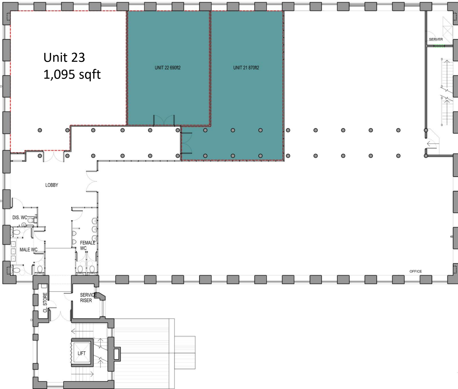
SECOND PROPOSED FLOOR